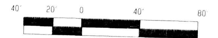
GRAPHIC SCALE IN FEET